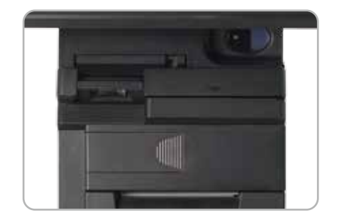
Optional Built-in MSR Fingerprint Sensor and RFID Reader