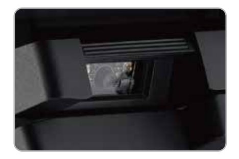
2D Barcode Scanner

Dressed from head to toe in timeless black or white color, the only trend that never goes out of style, and with stylish touches added throughout, the HS-6500 Series is not just a piece of machinery, it is an elegantly crafted piece of art that looks right at home in any store decoration.