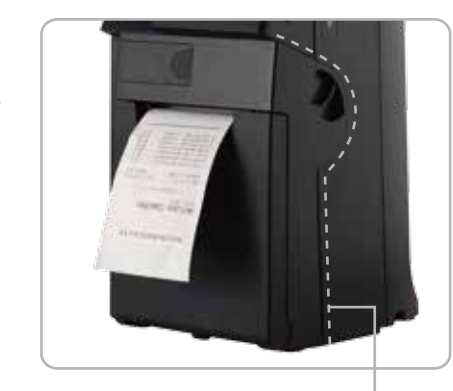
Detachable Receipt Printer •-

The HS-6500 Series integrates the most widely used peripherals including 3" thermal printer, MSR, fingerprint sensor, 2D barcode scanner and 2^{nd} customer display to support your daily POS operation. The detachable modularized design allows quick access to the components, enabling fast and easy service and upgrades.